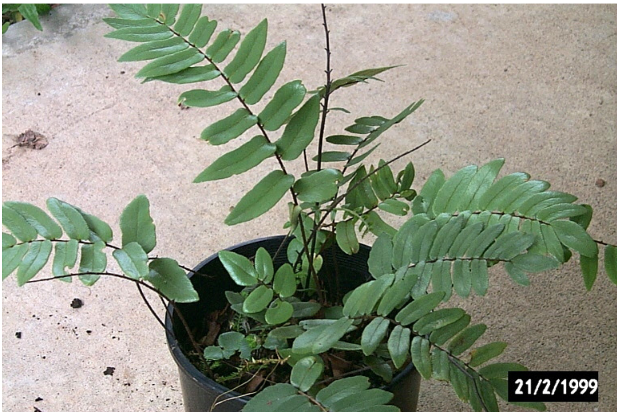
Pellaea 'Silver', also called Pellaea 'Herberton'. Cultivated in Bellbowrie.