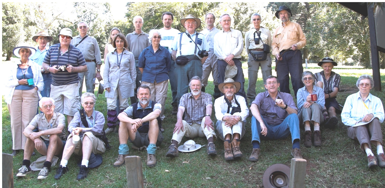
British Pteridological Society members and local members at Maiaia.

*this item will also appear in the newsletter of the British Pteridological Society, and may differ slightly from this version.